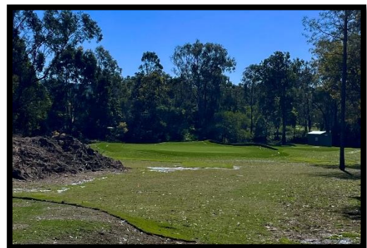
Temporary Hole Tee Box View #2

Immediately after the Club Championships are completed, we will start the rebuilding of the 5 th and 11 th greens. We will then bring the new holes into play. The putting surface component of the green will be completely removed, all the old growing medium replaced with clean amended sand and the surfaced re-grassed. The putting surfaces will be returned as close as possible to their current shape and weather permitting be back in play for opening day 2023.