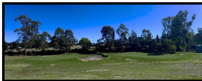
Greens of Temporary Holes

We have finally gotten through a month without any major rain for almost a year, and what a year it has been. As we look toward the opening of our new temporary holes bordering the 7 th green and 8 th tee, the reason we built these holes has become obvious after the very wet year we have had.