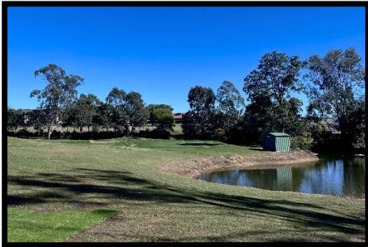
Temporary Hole Tee Box View #1

Our greens at Gailes were built to a masterplan during the late 1980's into the early 1990's replacing the very old blue couch greens that dated back before most could remember. They have served the club very well and the design and style that epitomises Gailes still holds true, but the quality of the growing medium has well and truly seen better days.